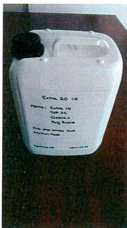
Fig. 1: Classic+, ref. No. 415600877/3