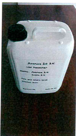
Fig. 1: Avenue 20, ref. No. 415600877/1