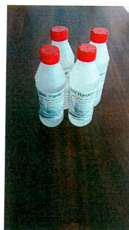
Fig. 2: Hardener, ref. No. 415600877/7